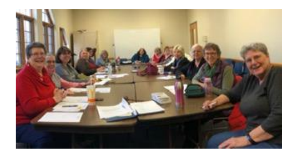
Council Meeting in Progress